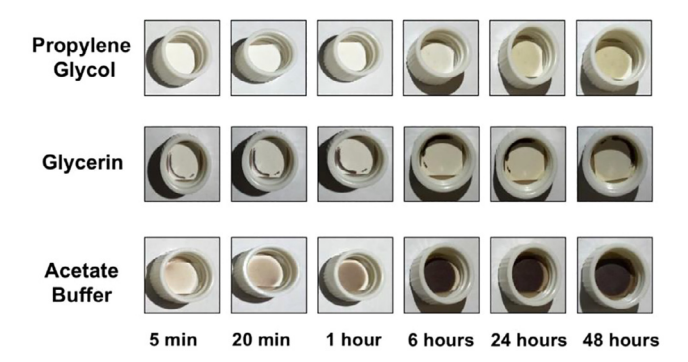
Fig. 2. Organic emollient formulation reduces I_2 vapor pressure and atmospheric loss. Using an iodine-sensitive paper disk assay, the relative vapor pressure of I_2 in glycerin and propylene glycol was compared to its vapor pressure in acetate buffer. Indicator paper stain intensity was visually evaluated using the Munsell Neutral Value Scale. The relative rate of staining per ppm of I_2 in propylene glycol and glycerin as compared to acetate was approximately 270 and 480 times lower.

calculated as 5003 centipoise (cP) at 25 °C and 3676 cP at 33 °C (Fig. 1). Viscosity of the I<sub>2</sub>-glycerin composition did not change with shear; this composition exhibited classical Newtonian behavior. The viscosities at 25 °C and 33 °C were 885 and 464 cP, respectively.